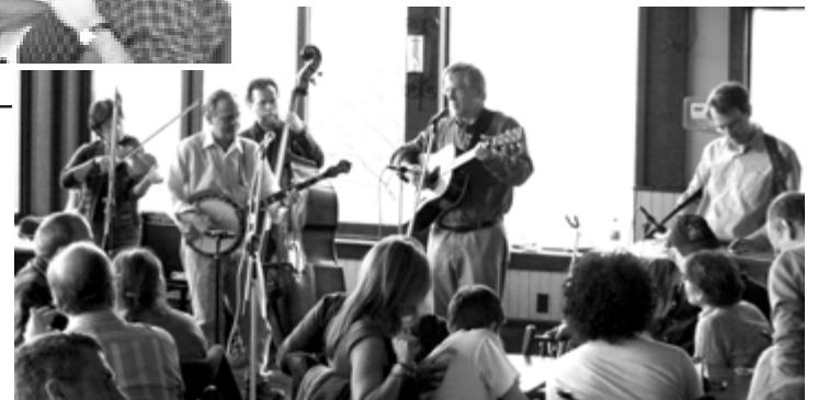
The Wickers Creek Band in a groove