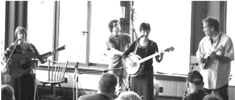
Headliners Too Blue