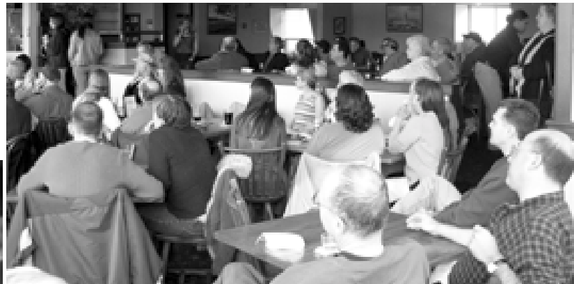
Full house at River Station