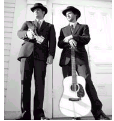
The Hunger Mountain Boys to headline BBB 2004

Blue Plate Special wowed the crowd at the HVBA's spring fundraiser at Banta's Steak 'n Stein. Their sound is a function of tight harmonies, hot instrumentals, outstanding songwriting, well-thought-out